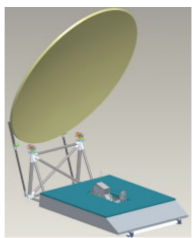
Figure 4. Outlook of Cloud Profiling Radar