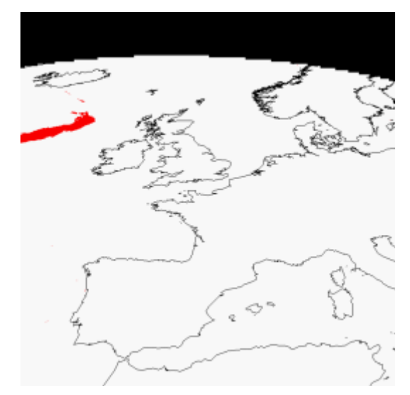
Figure 2: Volcanic ash index derived from a split-window thresholding technique also shows the extent of the ash plume, however in less detail than on the RGB above (product is for same time as Figure 1) (source: EUMETSAT)

Figure 1: MSG RGB composite using channels IR8.7, IR10.8 and IR12.0 for 09 May 2010, 0030 UTC. The bright pink/red colour well depicts the ash cloud. (source: EUMETSAT)