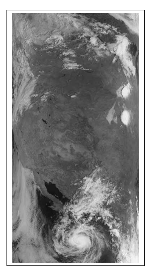
Fengyun 1D CHRPT