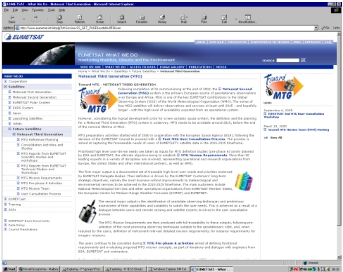
Figure 2 EUMETSAT entry to MTG web page