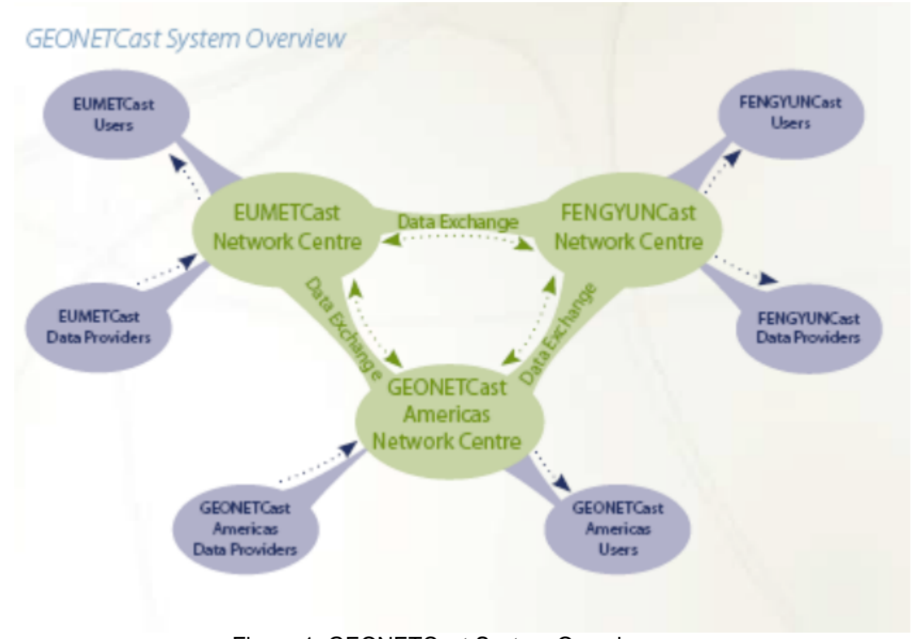
Figure 1: GEONETCast System Overview

The day to day management of each sector is their respective responsibility. The regional components include one or more data collection, management, and dissemination centres that receive, process, prioritise, and schedule the incoming data streams or products. Such centres are called GEONETCast Network Centres (GNCs).