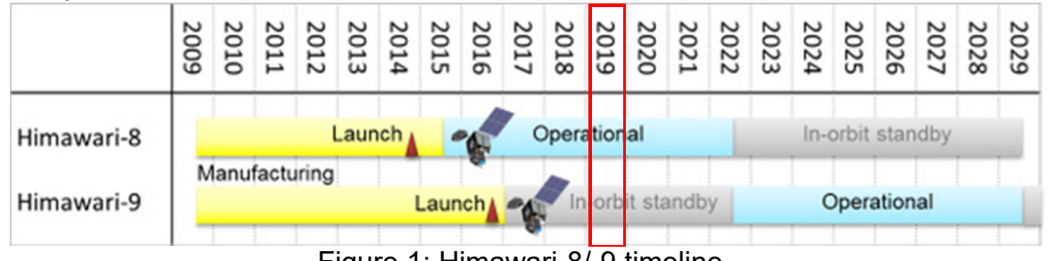
Figure 1: Himawari-8/-9 timeline

The Japan Meteorological Agency (JMA) operates two geostationary meteorological satellites, Himawari-8 and -9, equipped with Advanced Himawari Imager (AHI) units. JMA has established a satellite observation system with redundancy based on twin satellite operation, which is expected to contribute to disaster risk reduction in Asia and the western Pacific until 2029. Himawari-8 will chiefly be used for observation during the early part of this period, with Himawari-9 in a back-up role. Their operation will be switched in 2022 to place Himawari-9 in the main observation role with Himawari-8 as back-up.